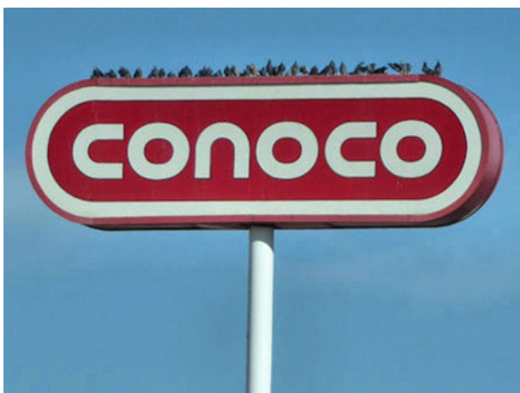
The age old philosophical question of how many pigeons can dance on the head of a Conoco sign is answered.